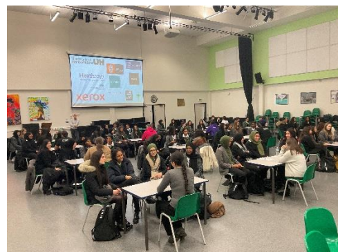
Female panel from SCS Railways