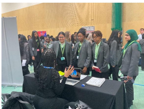
Pupils engaging with our exhibitors

The whole school careers fair took place on Wednesday 17 th January and this year consisted of over 40 different exhibitors. It was fantastic to have representatives from such a wide field of industries and further education establishments. We were also delighted to welcome back some of our fantastic alumni, who enjoyed the opportunity to give back to the school and engage with the younger cohorts and talk about their career pathways. All year groups were able to spend 45 minutes during the day exploring the fair and speaking to representatives in industry or further education establishments. The feedback from the pupils about the event and the day was extremely positive.