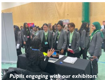
Pupils engaging with our exhibitors

The whole school careers fair took place on Wednesday 17 th January and this year consisted of over 40 different exhibitors. It was fantastic to have representatives from such a wide field of industries and further education establishments. We were also delighted to welcome back some of our fantastic alumni, who enjoyed the opportunity to give back to the school and engage with the younger cohorts and talk about their career pathways. All year groups were able to spend 45 minutes during the day exploring the fair and speaking to representatives in industry or further education establishments. The feedback from the pupils about the event and the day was extremely positive.