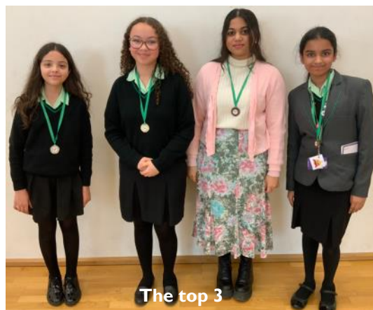
The top 3