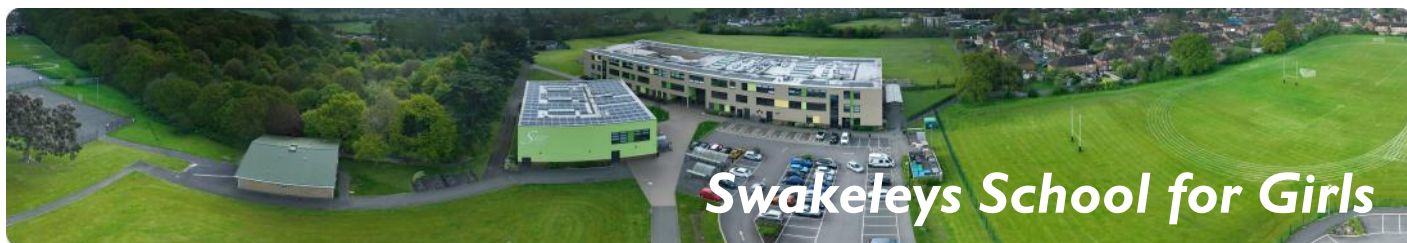
Swakeleys School for Girls

Other activities planned for our Year 11 pupils included a 6 th form taster day, an IAG (information, advice and guidance session) and a skills for life day which included a Q & A