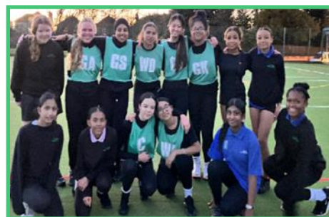
Year 8 and 10 Team