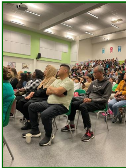
Thank you all for your support at our recent Parental Engagement Evenings for Year 7, 8 and 11